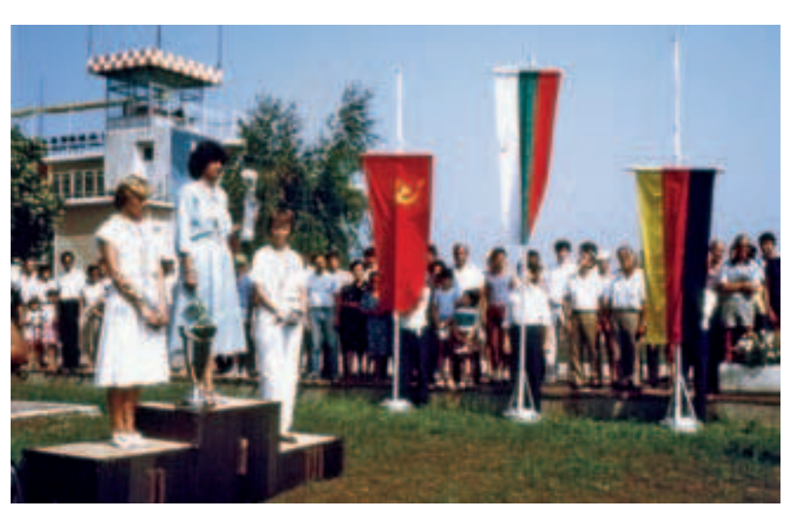
Podium 15 m class.