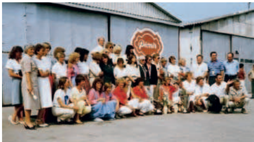
31 participants from 9 countries.