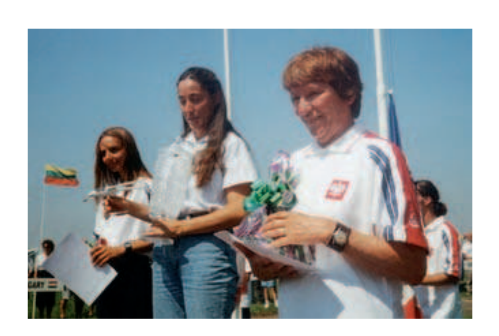
Club Class • 16 pilots • 8 contest days