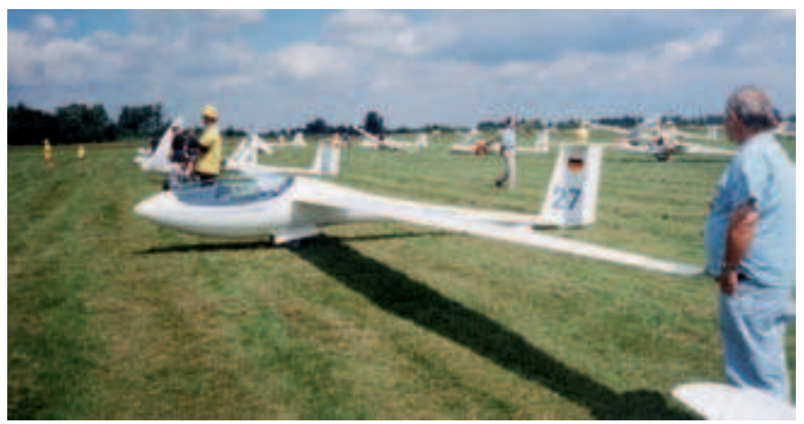
Bozena Demczenko - POL.

The 8th and last contest day brought a nice surprise, at the same time good propaganda for the glider type Lak 17 A of Lithuanian production and it was the experienced Lithuanian Edita Skalskiene who swept over the finish line after 353,3 km