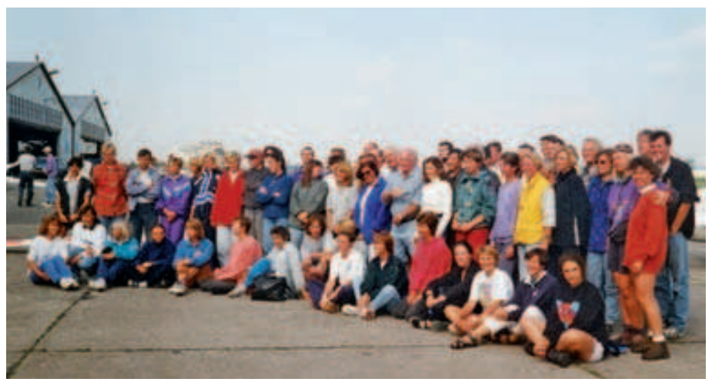
43 pilots from 10 countries.

The organizers offered snacks and beer, the French Team wine. World class pilots applauded and regretted, in male pilot circles there was no similar happy event organized.